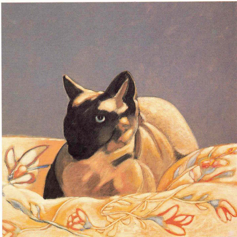
Interior. 92 x 92 cm.