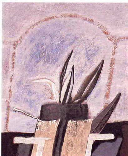
4 Variations 36 x 48 cm.